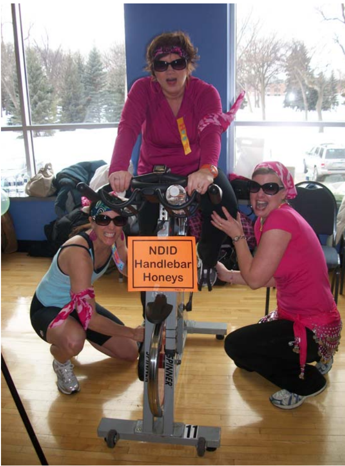
Weary legs get a little help.