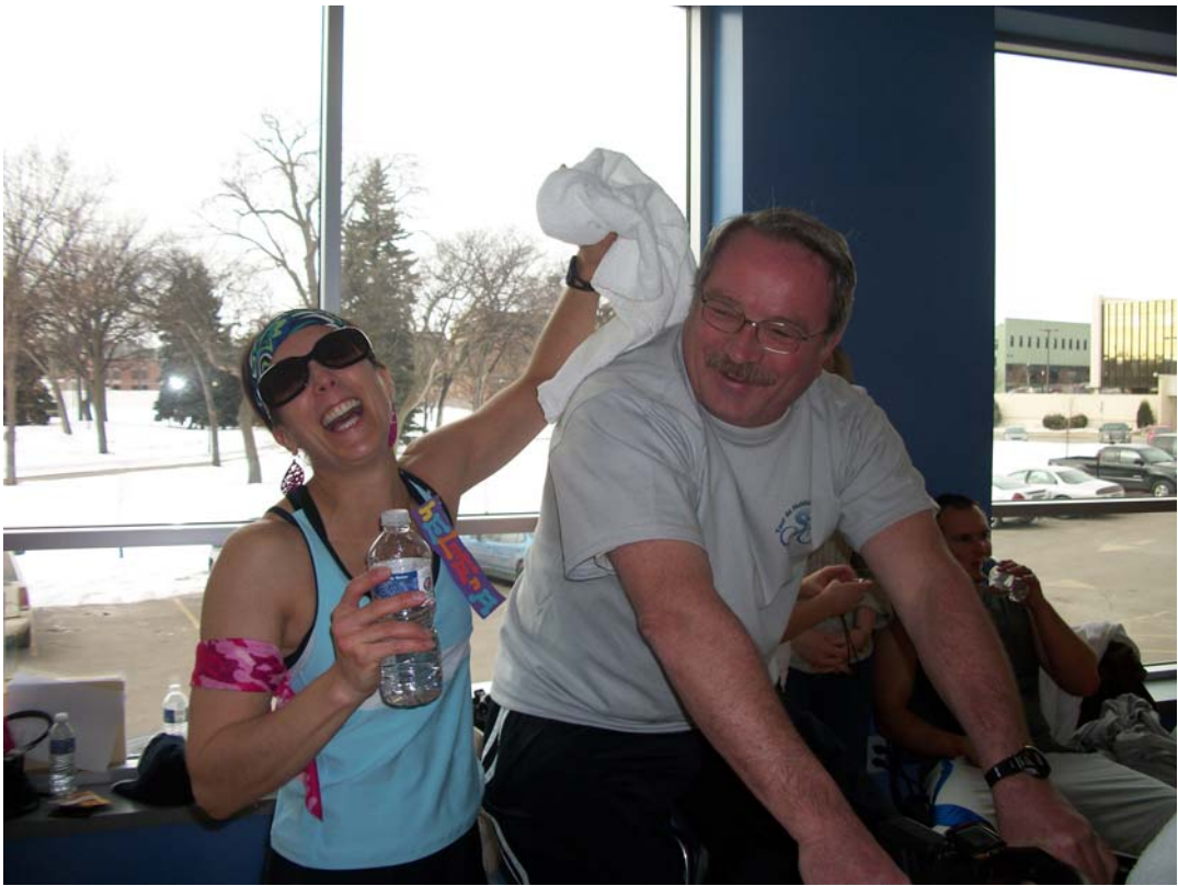
NDID members - always happy to help others!