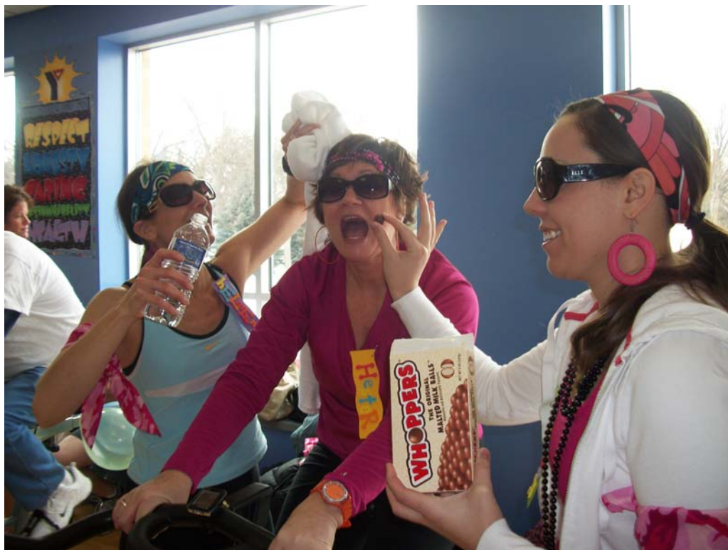
Crucial nourishment for optimal performance!