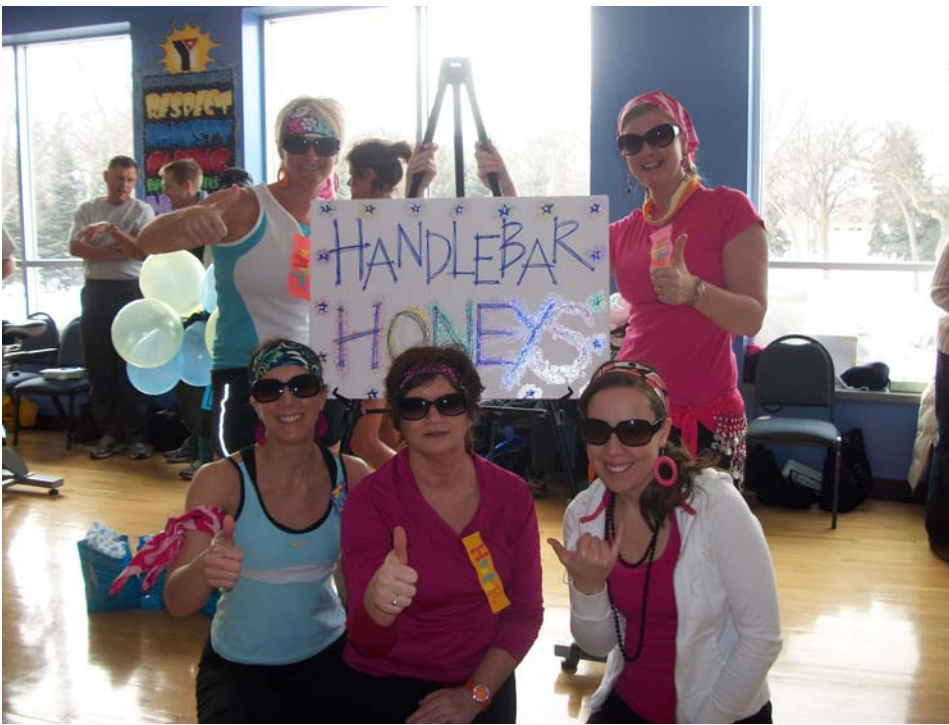
Cool riders like this event!!