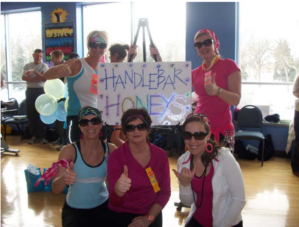
Cool riders like this event!!