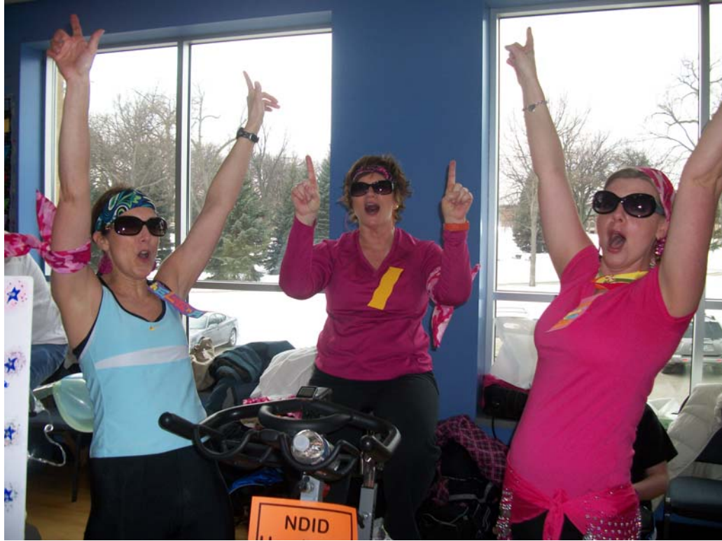
Excited to ride for a great cause!