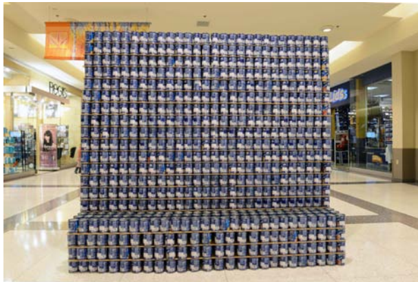
Lightowler Johnson & Associates "TogE.T.her we CAN end hunger!"