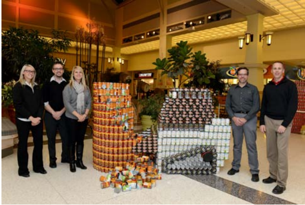
Schultz + Associates Architects and Bobcat Doosan Company "DeCANstruct Hunger!"