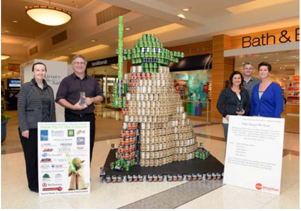
Foss Architecture & Interiors and Braaten Cabinets "Fight Hunger We Must!"