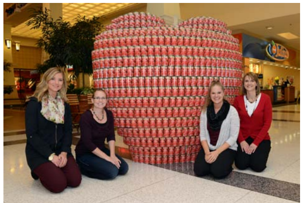
North Dakota Interior Designers (NDID) "The Giving Heart"