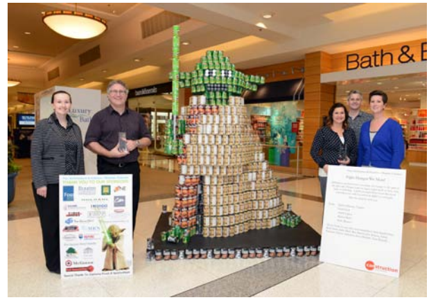
Foss Architecture & Interiors and Braaten Cabinets "Fight Hunger We Must!"